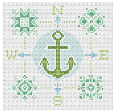
RPCSP AL423 Anchored Life 6" x 6"