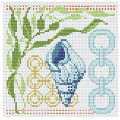
RPCSP MBH2422 Modern Beach House 2 5" x 5"