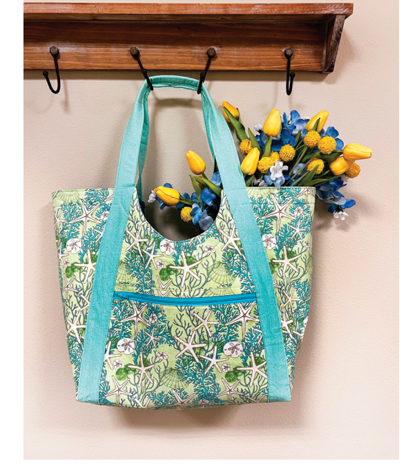
AG 533 Poolsize Tote by Noodlehead