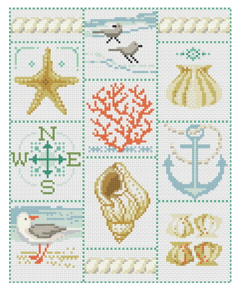
RPCSP SS425 Shoreline Sampler 8" x 10"