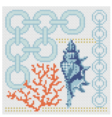
RPCSP MBH1421 Modern Beach House 1 5" x 5"