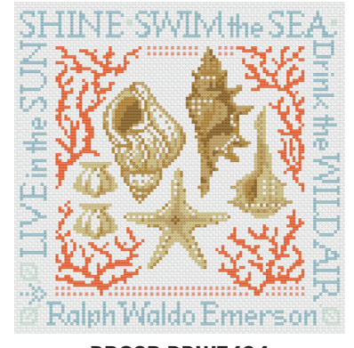
RPCSP BDWE424 Beach Day with Emerson 8" x 8"