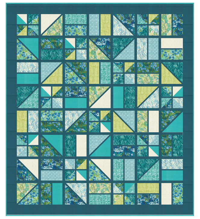
Lagoon Version Twin 74 1/2" x 83 1/2"