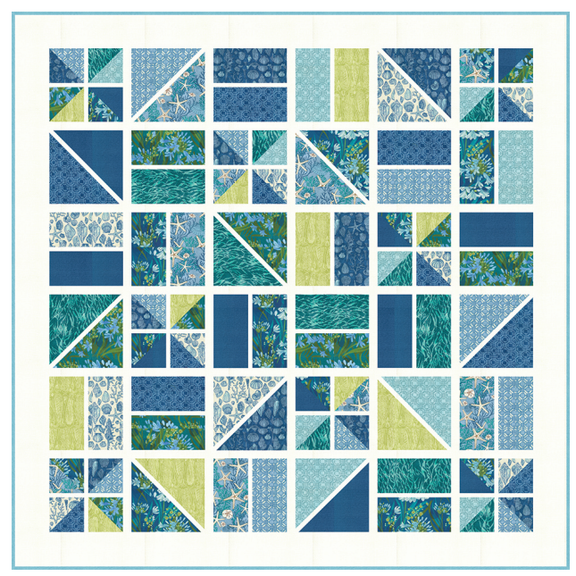
Cream Version Lap 64 1/2" x 64 1/2"