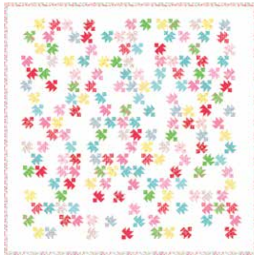
PBH 2387 / PBH 2387G Starlings Size: 76" x 76" (additional sizes and colorways available)