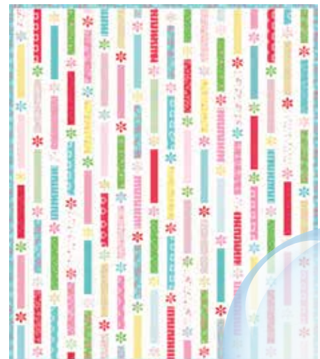
PBH 2394 / PBH 2394G Clematis Size: 72" x 76" (additional sizes and colorways available)