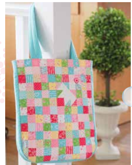
PBH 2424 / PBH 2424G Lovebird Tote Size: 11" x 13" x 2"