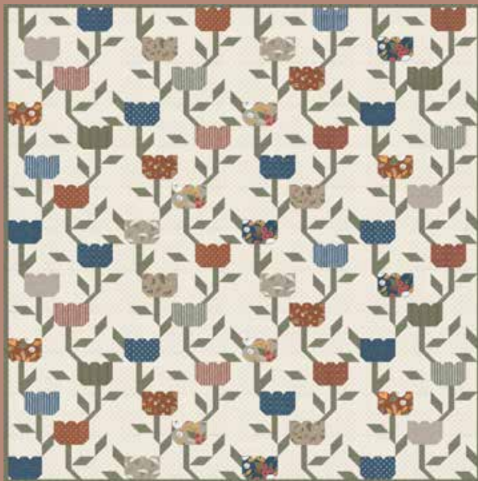
LB 208 Flourish Cream 80" x 80" F8 Friendly