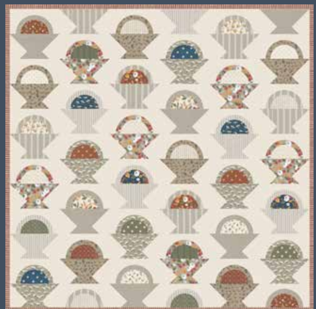
LB 207 Gather Cream 72" x 72" LC Friendly *Navy option available