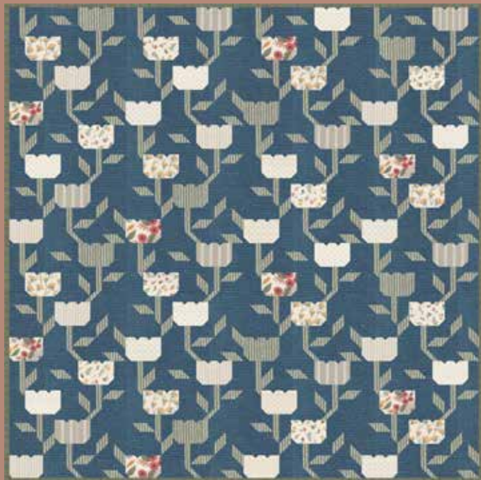
LB 208 Flourish Navy 80" x 80" F8 Friendly