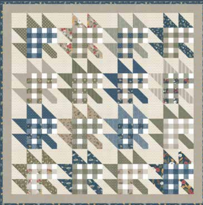
LB 206 Gingham Style 80" x 80" FQ Friendly