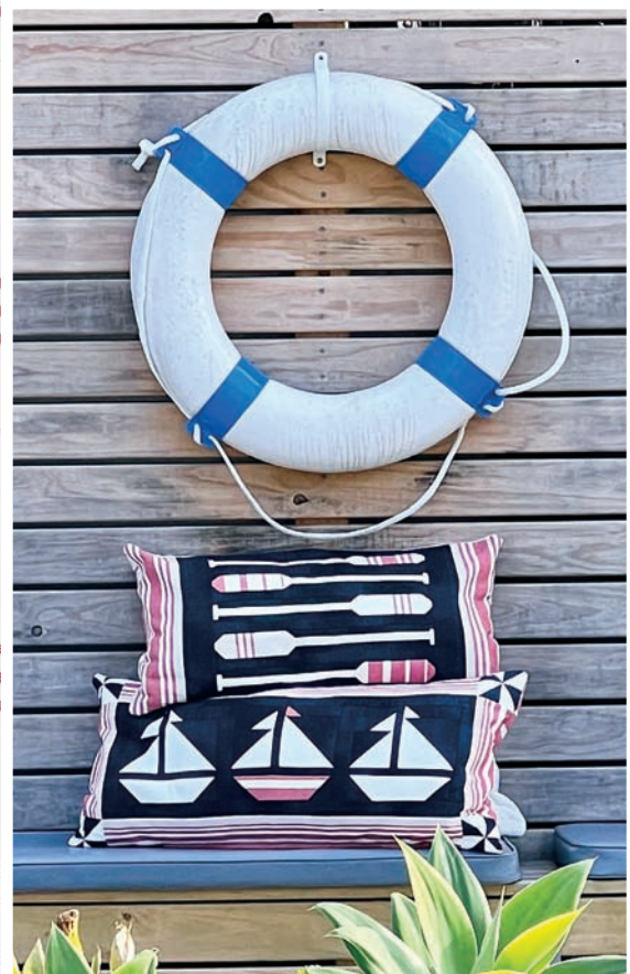
PTT 250 Nautical Pillows - Oar Pillow 14" x 24" Sailboat Pillow 14" x 29"