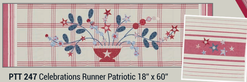
PTT 247 Celebrations Runner Patriotic 18" x 60" Patriotic Table Napkin 18" x 18"