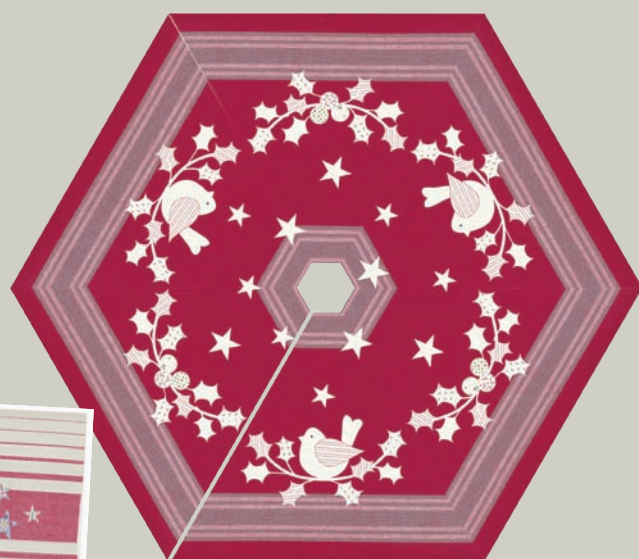
PTT 248 Snowbird Tree Skirt 40" Diameter