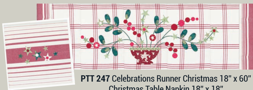
PTT 247 Celebrations Runner Christmas 18" x 60" Christmas Table Napkin 18" x 18"