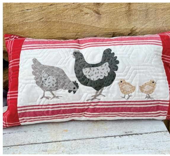
Hen And Chick Pillow 18" x 32"