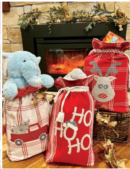
PTT 251 Santa Sacks 17" x 28" x 4"