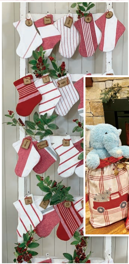
PTT 230 Mini Christmas Stocking 6" x 8"