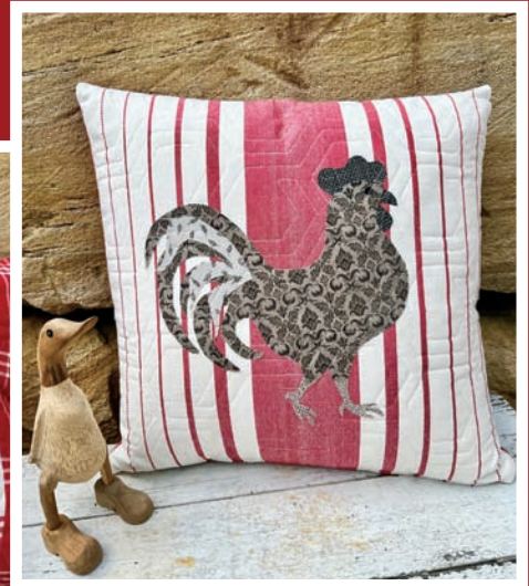
Rooster Pillow 18" x 18"