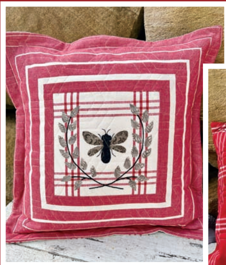
Bee Pillow 18" x 18"